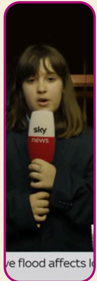
ve flood affects l

Our first recording wasn't the best one but the more we practised the better we got. It was so much fun performing in front of the camera. We even got to use a proper technical and complicated camera, not just a normal iPad camera.