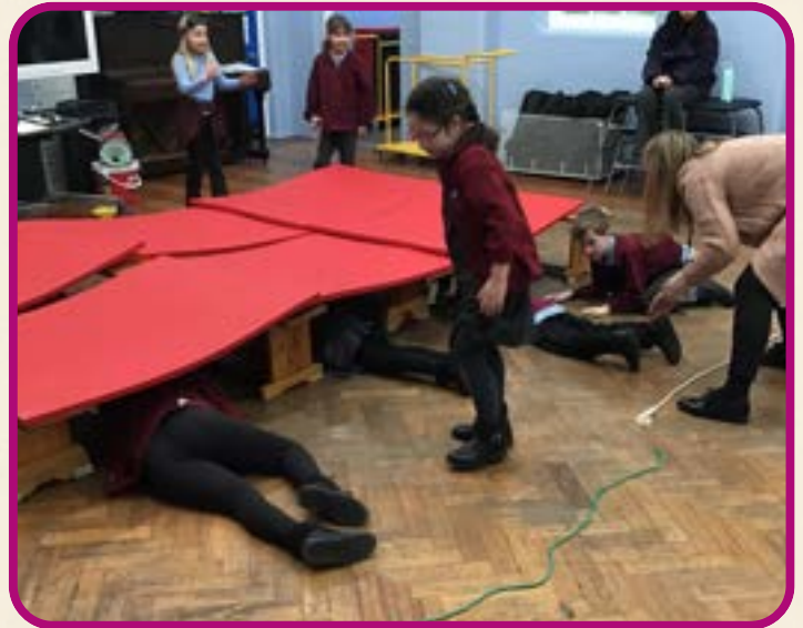
Year 2 have been exploring how their senses change in the dark through blind-folded, and peer supported, obstacle courses. This was part of our exploration linked to our new class text.