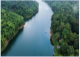
Rivers and History of the River Thames