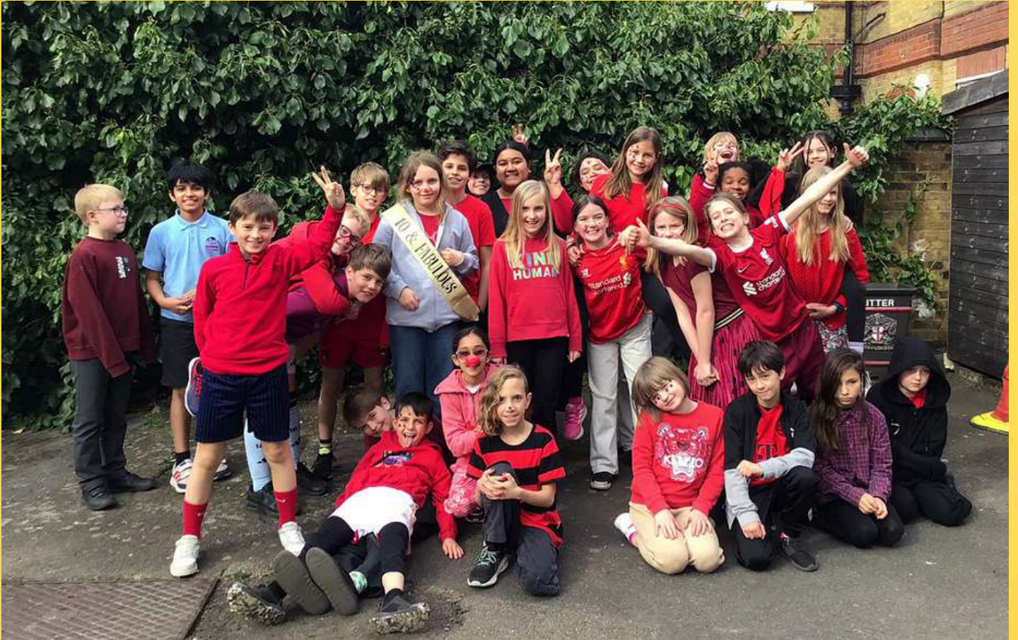
5J wearing red for Red Nose Day!