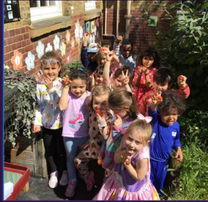
Reception growing strawberries