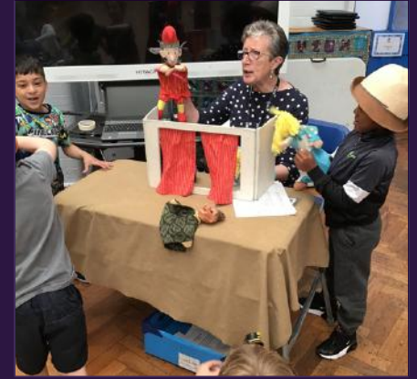
Year 1 Seaside Day