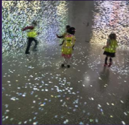
The Frameless Gallery