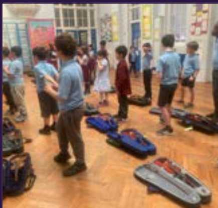
Warming up in Violins