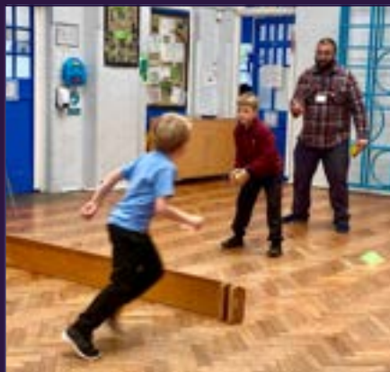
Year 2 PE