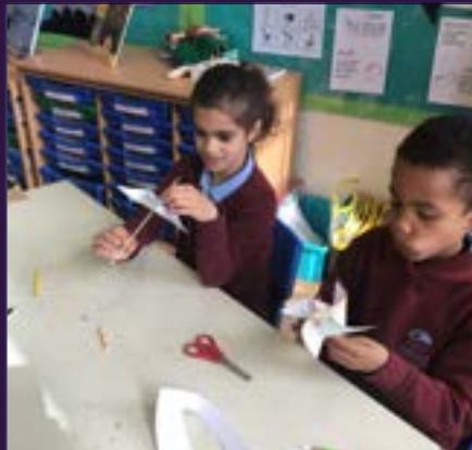
DT in Year 3