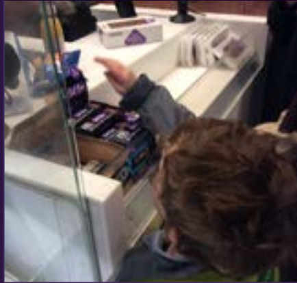
Using money in real life