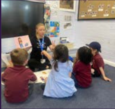
STorytime in Nursery