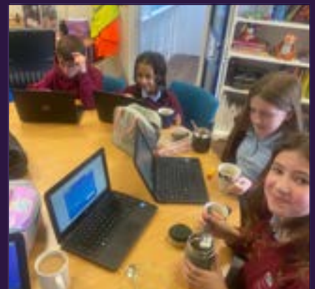
Lunchtime tea with the Headteacher