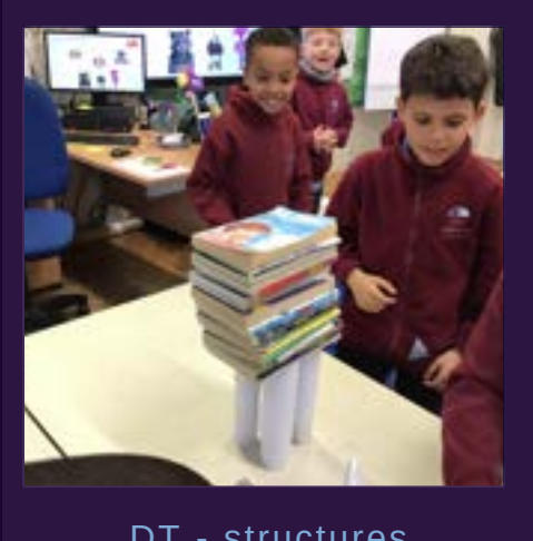
DT - structures