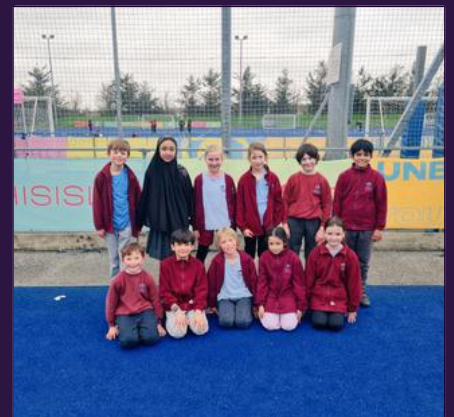
London Youth Games