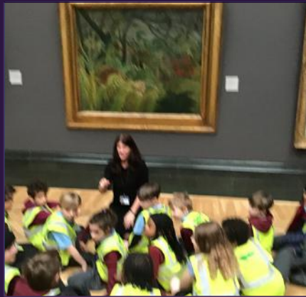
Visit to the National Gallery