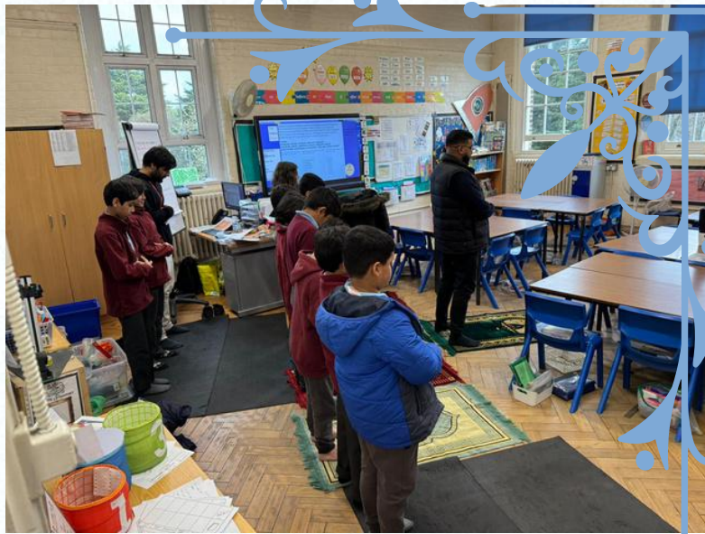
Some children and staff praying during Ramadan