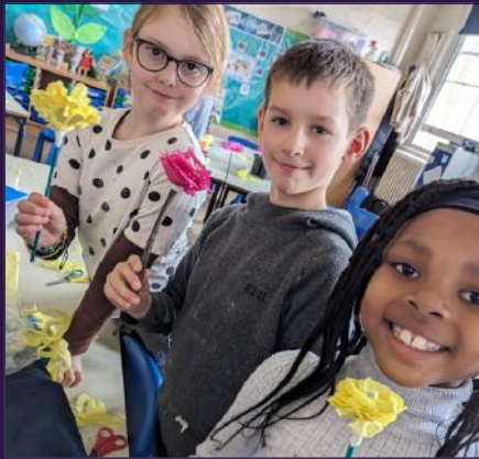
Making flowers and pots