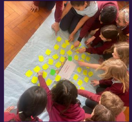
School Parliament meeting